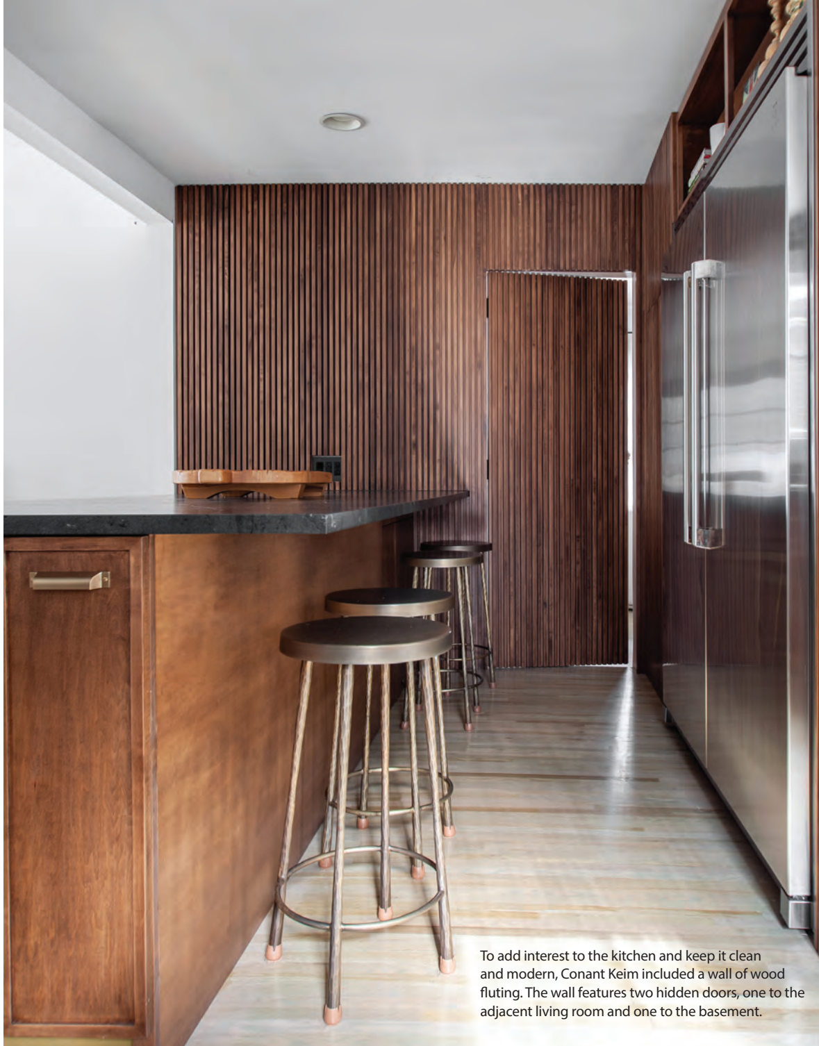
To add interest to the kitchen and keep it clean and modern, Conant Keim included a wall of wood fluting. The wall features two hidden doors, one to the adjacent living room and one to the basement.

have been on the neutral bandwagon ever since. And as I got older, my style evolved and it became more classic and timeless with more lasting power.”